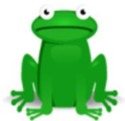
Princess and the Frog