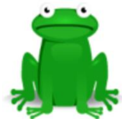
Princess and the Frog