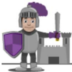
Guard the Castle

In Computing, we have continued our work on coding. Coding can be a very tricky skill for children to learn. It forms a very large part of our Computing curriculum and children are able to build on their skills each year. Below are just some of the Purple Mash coding programmes that we use in year 2.